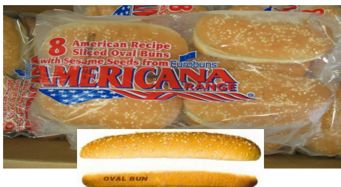
Ref.2382 - Oval Seeded Buns - 12,5cm - 67gr - 6x8pcs