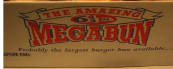
Ref. 2375 - Mega Burger Buns - Semolina Topped - 16cm - 125gr - 6x4pcs