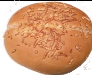
Ref. 2362 - Burger Bun Emmenthal 11,5cm - 74gr - 32pcs