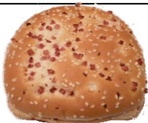
2365 - Burger Bun Square - Sesam / Bacon 10cm - 115gr - 32pcs