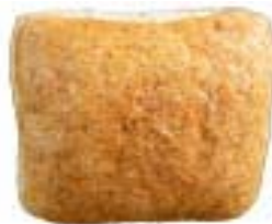
Ref. 2355 - Sandwino Chili Bun 11x11cm - 100gr - 30pcs