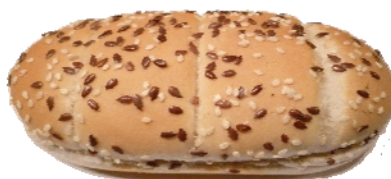
2366 - Burger Bun - Oval Sesam / Line seeded 13x7cm - 125gr - 32pcs