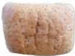
Ref. 2354 - Sandwino Herb Bun 11x11cm - 100gr - 30pcs