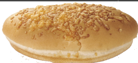
Ref. 2363 - Burger Bun Oval - Red Cheddar Cheese 13x9cm - 64gr - 32pcs