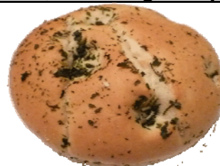
2364 - Burger Bun Foccaccia 10cm - 75gr - 32pcs