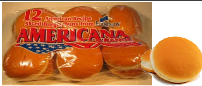
Ref. 2376 - Burger Buns Unseeded 10cm - 53gr - 4x12pcs