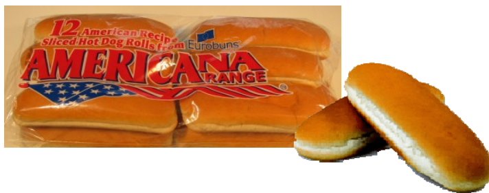
Ref. 2383 - Hot Dog Roll - Side Sliced - 16,5cm - 50gr - 4x12pcs