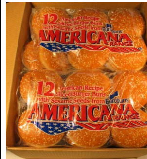
Ref. 2377- Burger Buns Seeded - 10cm - 53gr - 4x12pcs