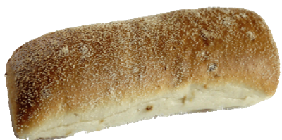
Ref. 2358 - Sandwino onion 18x6cm - 90gr - 30pcs