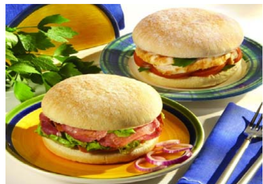
Ref. 2380 - Floured Bap - 13cm - 6x8pcs Ref. 2381 - Floured Bap - 10cm - 4x12pcs